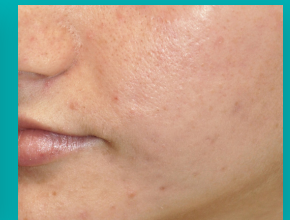
After 8 Treatments