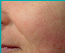
After 6 Treatments